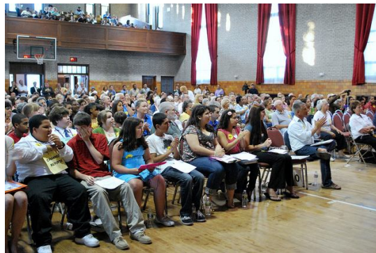
UIA Education Public Action. June 2011. Our Lady of Mount Carmel Catholic School, New Bedford, Massachusetts