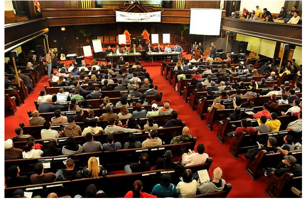
UIA Immigration Rights Public Action at Christ Is Life Presbyterian Church / First Baptist Church. June 18, 2011 Fall River, Massachusetts